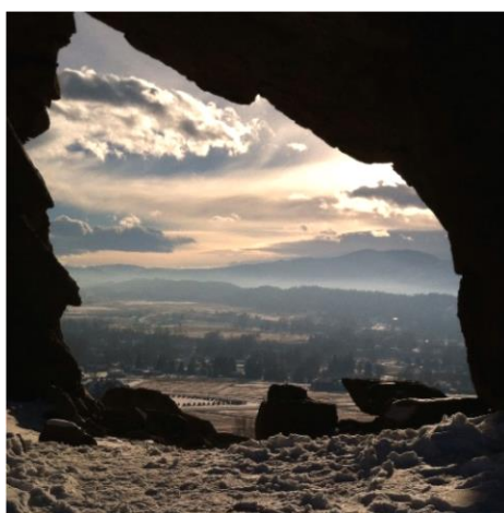
Keyhole at Devils' Backbone, Loveland, CO