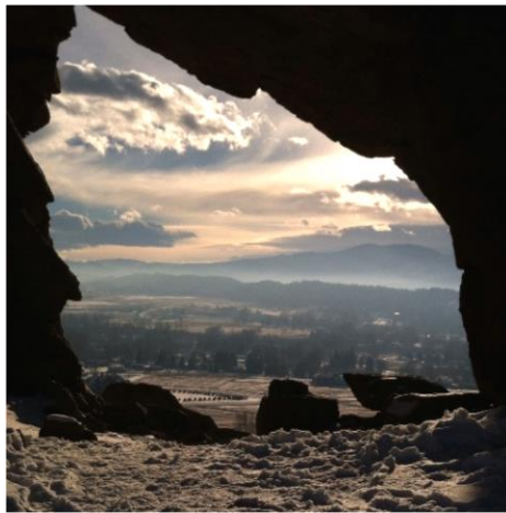
Keyhole at Devils' Backbone, Loveland, CO